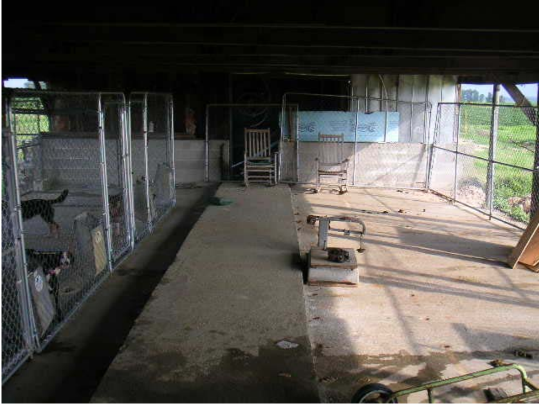
Kennels are being built under the shed.