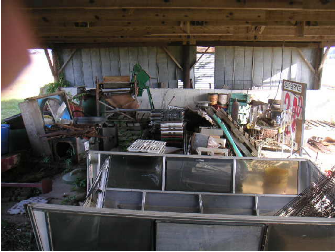
A shed full of junk!