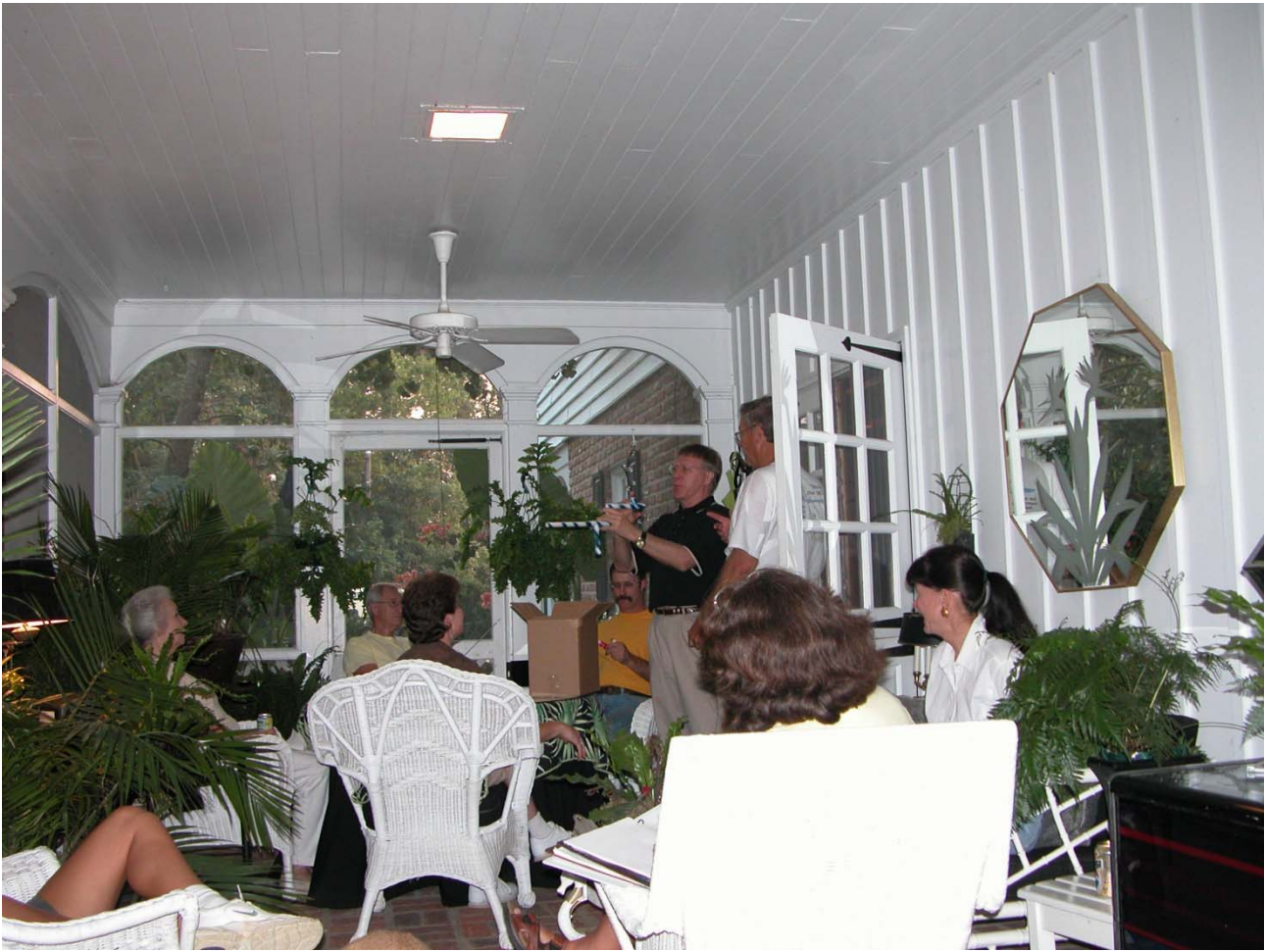
A DEAR meeting on my back porch.