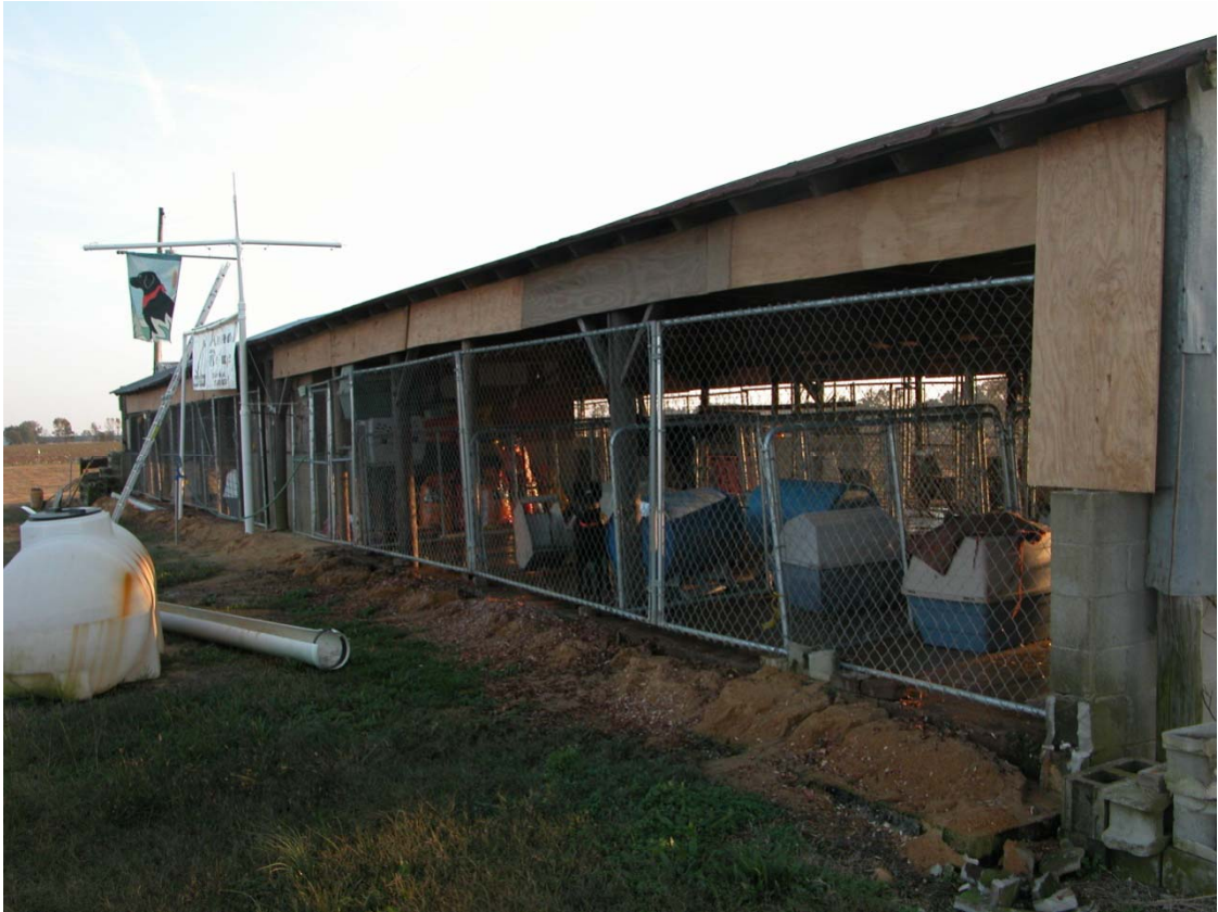
More construction in progress.