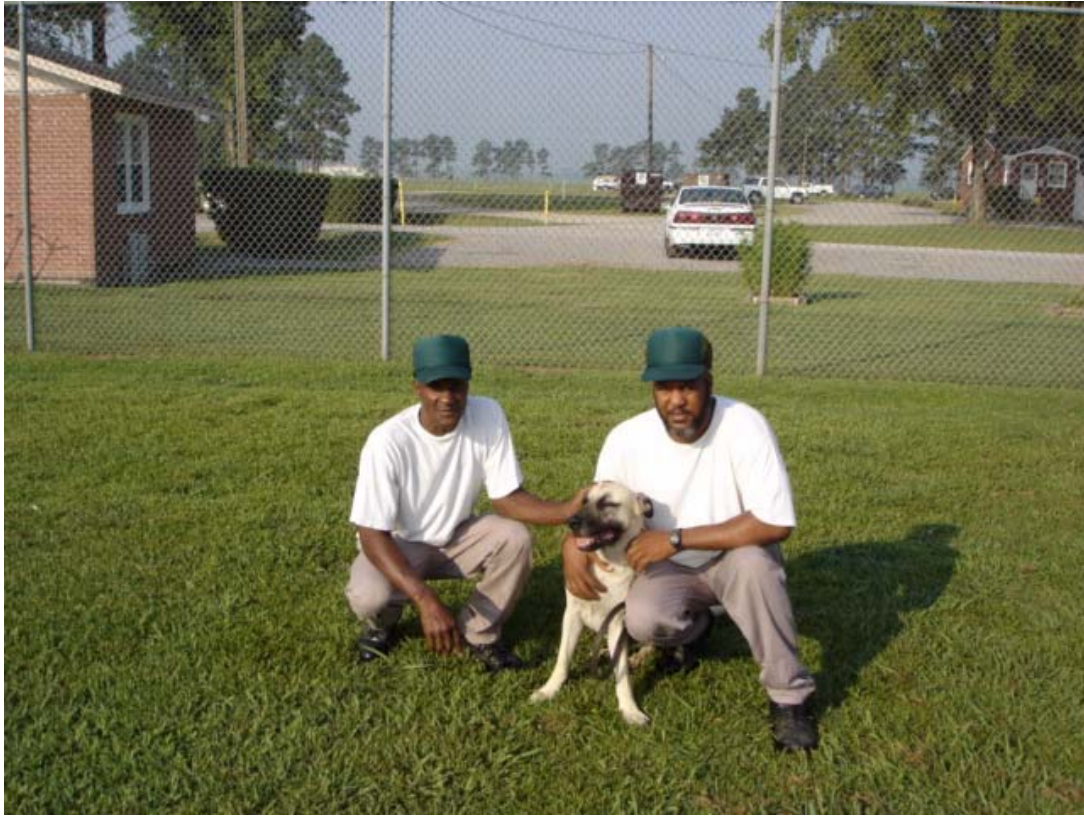
Hoss, one of our all-time favorites, sits with his trainers.